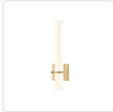
WS83218-BG Brushed Gold